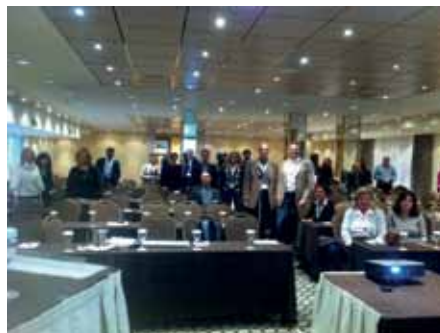
A group of the audience who attended the meet-the-expert session in Athens, Greece.

Athens (Greece) on November 29-December 2, 2012, offered the ideal launching pad for this new initiative. Our section organized two activities: a meet-the-expert session and