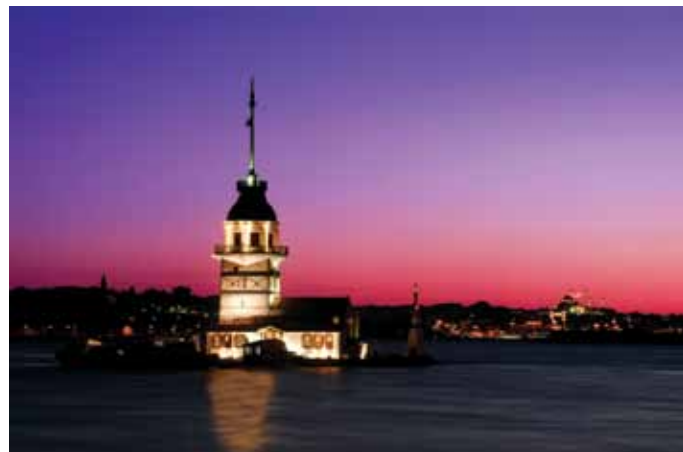
The Maiden's Tower.

The Social and Cultural Programme will cover various activities, reflecting the richness of multi-cultural features of Istanbul.