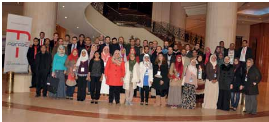
A group of participants who attended the 1st International Congress of Early Career Psychiatrists in Cairo, Egypt.

The Early Career Psychiatrists section of the Egyptian Psychiatric Association organized the first international congress targeting early career psychiatrists as the main audience. It was an initiative aiming to allow early career psychiatrists (ECPs) from all over the world to share their experiences and knowledge, and to establish new networks and friendships. Distinguished speakers and professors participated to help developing ECPs skills and training through keynote lectures, workshops and symposia. The congress was organized by the Early Career Psychiatrists section of the Egyptian Psychiatric Association in collaboration with several other associations including: the European Federation of Psychiatric Trainee (EFPT), Asian Federation of Early Career Psychiatrists (AFCEP), Japanese Young Psychiatrists Organization (JYPO), Taiwanese Young Psychiatrists Organization (TYPO), Russian Early Career Psychiatrists Council, Swiss Association of Psychiatric Trainee, Czech Psychiatric Association, Belarusian Psychiatric Association, Young Psychiatrists Network and the Society for Trans-cultural Psychiatry in the German Speaking Region (DTPPP). The congress was co-sponsored by the World Psychiatric Association (WPA), European Psychiatric Association (EPA) and Asian Federation of Psychiatric Associations (AFPA).