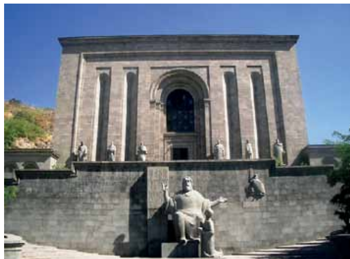
Matenadaran - Mesrop Mashtots Institute of Ancient Manuscripts, and Monument of Saint Mesrop Mashtots - the founder of Armenian alphabet.

We are proud to be a part of an organizing team and believe that you will enjoy not only the Conference itself but our social program as well as your stay in Armenia.