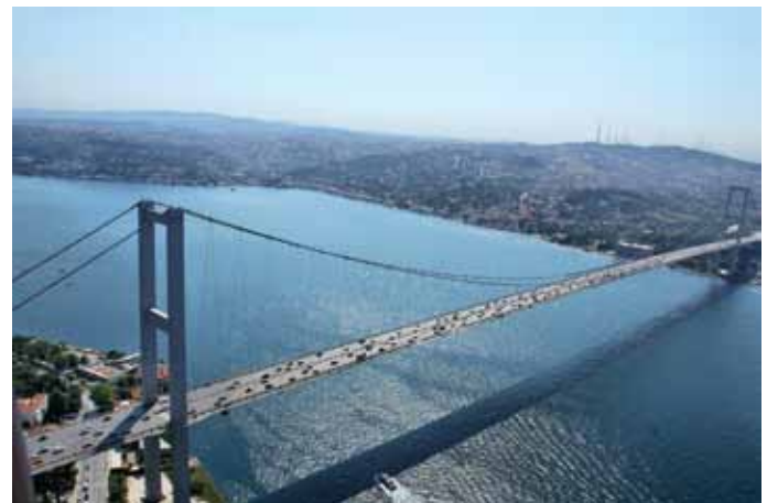
Psychiatrists of the world will meet where the continents meet in Istanbul in June 2013.

We are sure that you will consider actively contributing to the scientific programme and looking forward to meeting you where the continents meet in the summer of 2013.