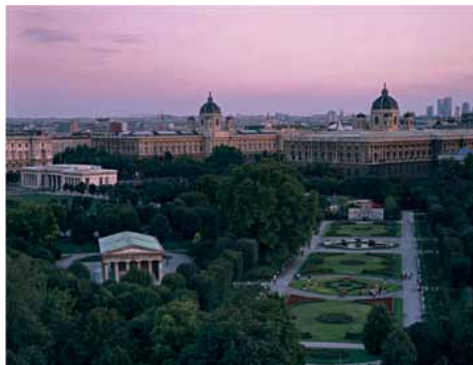
City of Vienna.