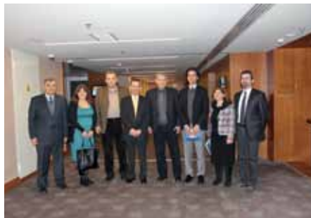
A group of delegates at the joint PABH/TAP meeting held in Istanbul, Turkey.

The TAP representatives have indicated their professional and scientific capabilities